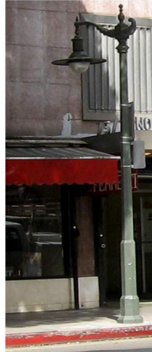
LED PEDESTRIAN LIGHTING TO MATCH EXISTING