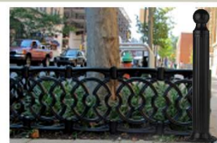
PLANTER RAILING AND PEDESTRIAN BOLLARDS AT BUMPOUT AREAS