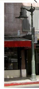
LED PEDESTRIAN LIGHTING TO MATCH EXISTING