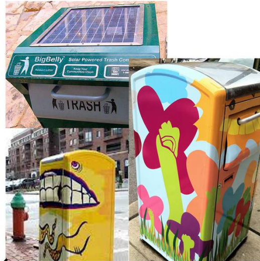
BIG BELLY TRASH Custom Color Panels