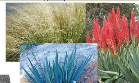
DROUGHT TOLERANT LANDSCAPE PLANTING AT BUMPOUT AREAS