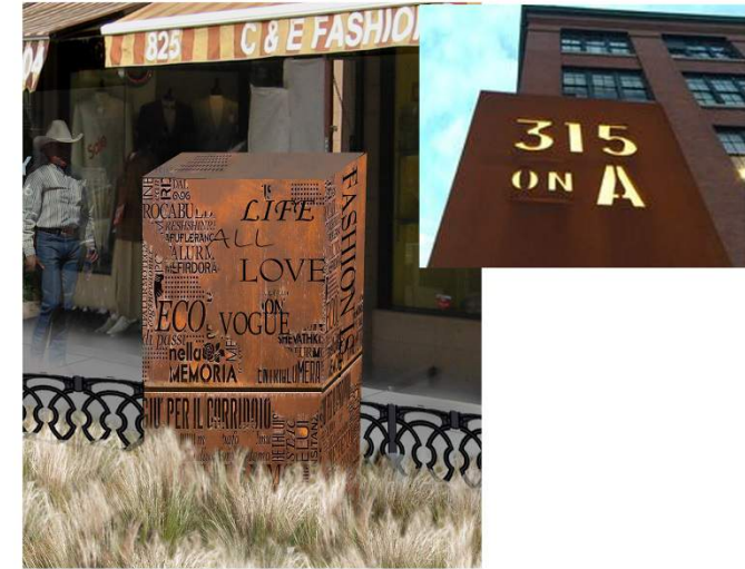
ART MONUMENT ALTERNATE

LANDSCAPE PEDESTRIAN BUMP OUT Special Paving, Art Monument, Drought Tolerant Landscape, Decorative Planter Rail, and ADA Access