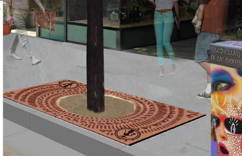
IRON TREE GRATES WITH CUSTOM LOGO AND NEW ARISTOCRAT CALLERY PEAR TREE