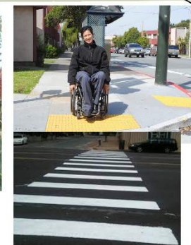
CONTINENTAL CROSSWALK AND ACCESS RAMP IMPROVEMENTS