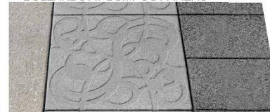
'TERRAZZO' AND 'GRANITE' FINISH SPECIAL PAVERS AT BUMPOUT AREAS