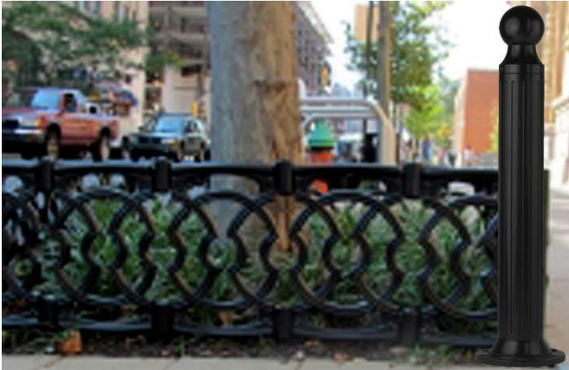
PLANTER RAILING AND PEDESTRIAN BOLLARDS AT BUMPOUT AREAS