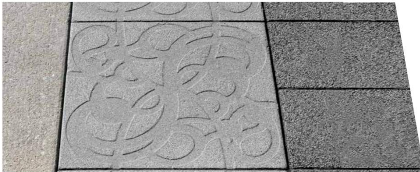
'TERRAZZO' AND 'GRANITE' FINISH SPECIAL PAVERS AT BUMPOUT AREAS