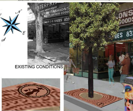
IRON TREE GRATES WITH CUSTOM LOGO AND NEW ARISTOCRAT GALLERY PEAR TREE