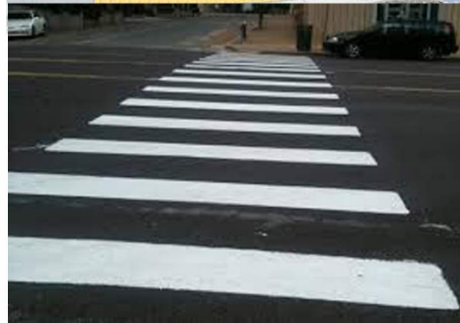
CONTINENTAL CROSSWALK AND ACCESS RAMP IMPROVEMENTS