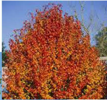
ARISTOCRAT FLOWERING PEAR TREE 25-25' TALL, 15-18' WIDE, WHEN MATURE