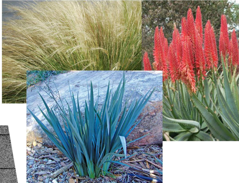
DROUGHT TOLERANT LANDSCAPE PLANTING AT BUMPOUT AREAS